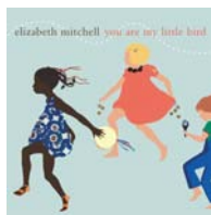
You are My Little Bird (J CD MIT)