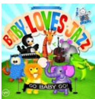
Go Baby Go! (J CD BAB)

Check out our great CD collection! This week's recommendations include: