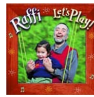
Let's Play! (J CD RAF)